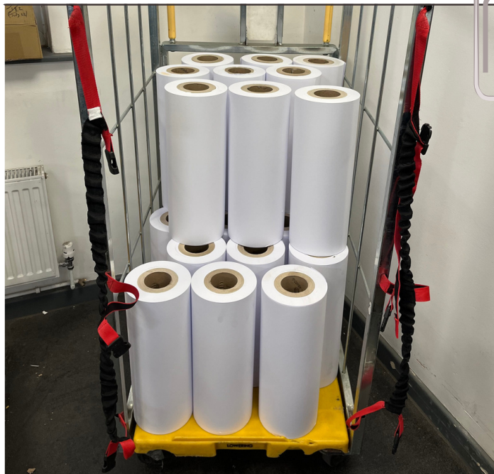
Ready to recycle!

(the centres of the rolls are too small to be used on the machines)