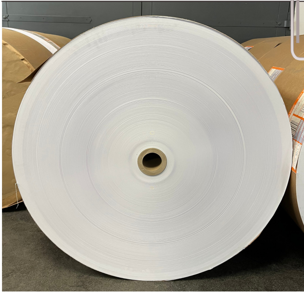
Our rolls start like this...